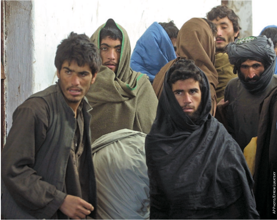
Prisoners in Shibergan Prison in Afghanistan in December 2001. U.S. forces sealed off the northern Afghanistan prison on December 29, so they could transfer detainees, foreigners, and possibly some Afghans, to a staging area for suspected al Qaeda and Taliban members, some of whom could face U.S. military tribunals.

Most of the constitutional protections afforded to criminal defendants have been developed only within the last fifty years by the U.S. Supreme Court's interpretation of the Constitution. Such interpretation has taken place solely within the context of a criminal justice system that is willing to set a guilty person free rather than possibly convict an innocent person. Our justice system affords more rights to the accused than does any system in the entire world. The "cost" of this system to our society has been acceptable.