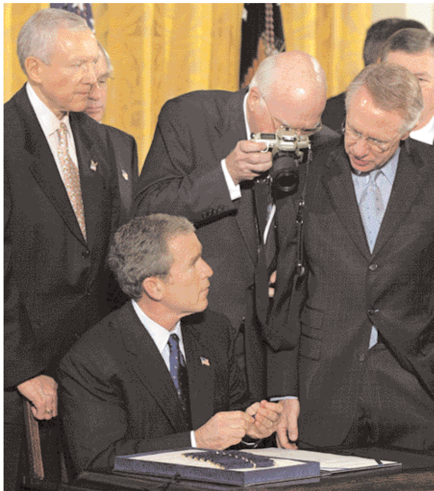
Sen Patrick Leahy (D-Vt.) peers over the shoulder with his camera as President Bush signs the USA PATRIOT Act Bill during a ceremony in the White House East Room, on October 26, 2001. The law gives police unprecedented authority to search people’s homes and business records secretly and eavesdrop on telephone and computer conversations. Left to right are: Sen. Orrin Hatch, R-Utah, Patrick Leahy, D-Vt., Sen. Harry Reid, D-Nev.