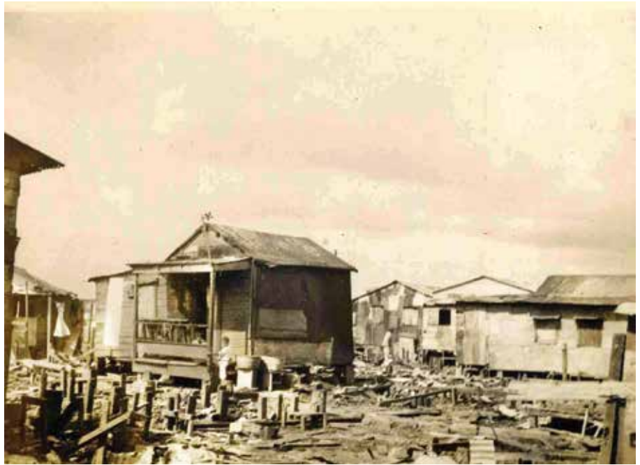
Shacks in a Slum in Puerto Rico; ca. 1939

Another activity that requires close visual analysis and careful observation has students take on the role of the researcher putting the Slum Clearance