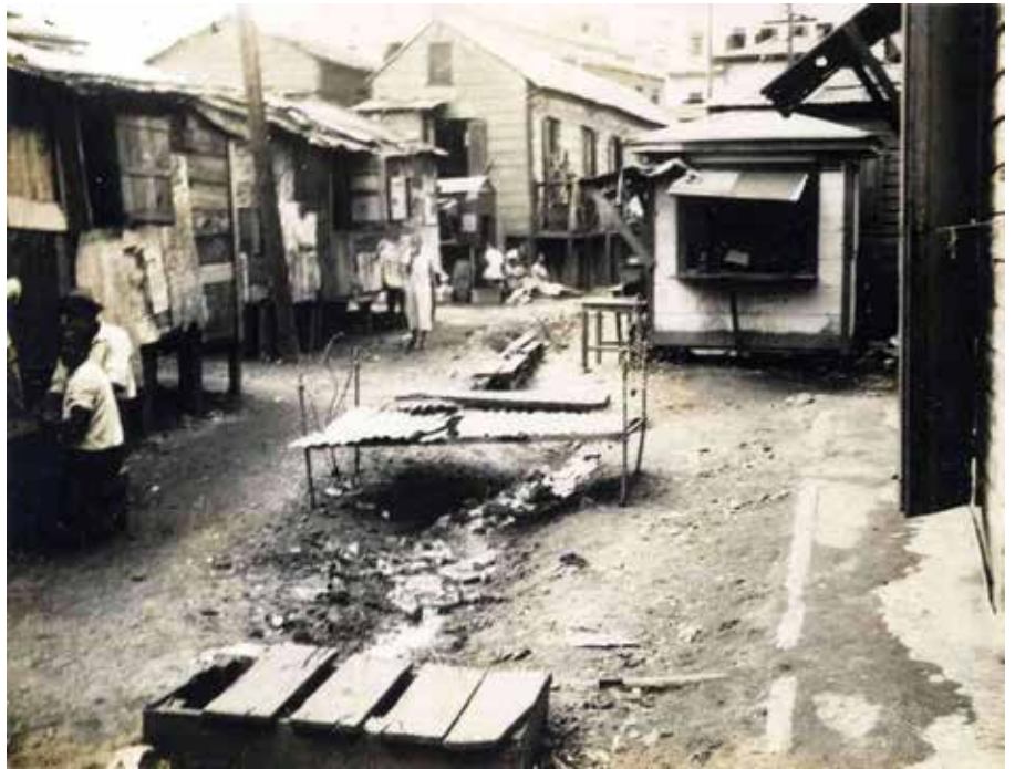
Street Scene in a Slum in Puerto Rico; ca. 1939

Report together. This assignment can also be a group project in which students put together the report using several pictures of Puerto Rico’s slums circa 1939, leading to a potential presentation (digital or in-person) on the students’ recommendations for steps that would facilitate Puerto Rico’s progression to a higher standard of living under its own