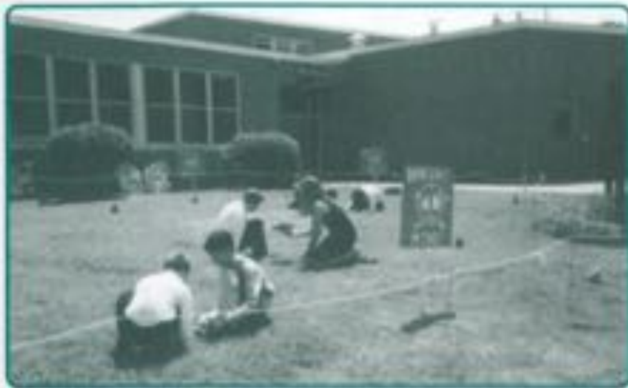
Ternally Middle School students examine mock landmine.

implementation of future school-wide non-violence events. In addition, teachers from each grade level of Ternally Middle School volunteered to be part of a brainstorming and advisory council that met once a week to assist the student and adult groups.