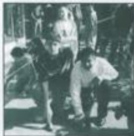
Members of Ternally Middle School Landmine Awareness Club touch mock landmines.

Our middle school had begun a serious, common inquiry into ethical principles and concepts. We were raising our awareness of and respect for values grounded in a humanitarian perspective.