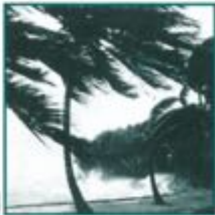
Palm trees bend as hurricane waves strike a sea wall.