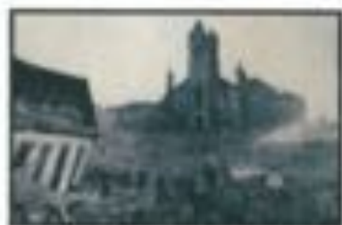
Damage caused by the hurricane and storm surge in Galveston, 1900.

Many musicians have performed “Mighty Storm,” also called “Galveston Flood,” sometimes altering the words a bit, so now it exists in several different forms. 3 An early recording of the song is in the folk music collection of the Library of Congress.