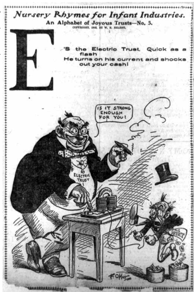
Nursery Rhymes for Infant Industries. An Alphabet of Joyous Trusts—no. 5 / F. Opper (c1902).