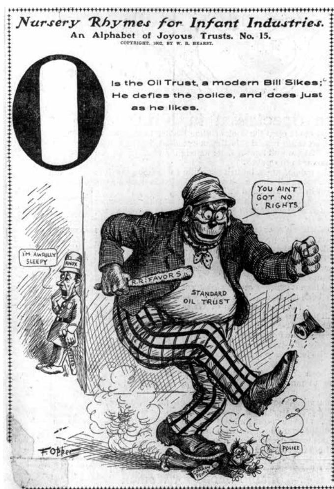
Nursery Rhymes for Infant Industries. No. 15: 'O' is for Oil Trust, a modern Bill Sikes; he defies the police, and does just as he likes (c1901).

by Hearst to draw for the New York Journal in 1899, and with Hearst's support, Opper published a 1900 series titled "Willie and Papa," mocking then President William McKinley in his reelection campaign. He drew President McKinley as an infantile four year old (representing his first term in office) under the tight control of trusts and powerful political operatives.