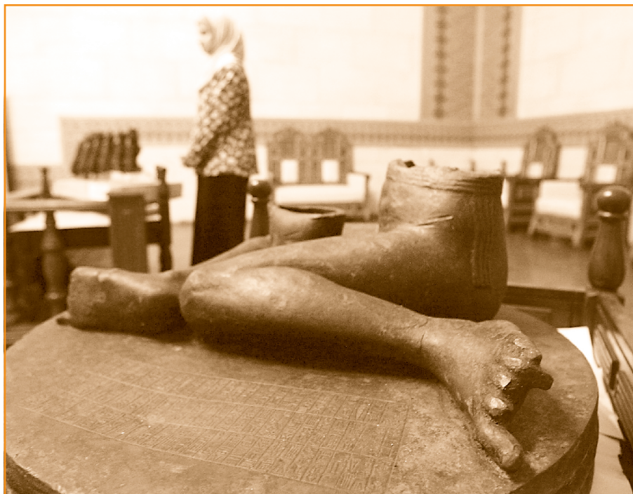
Several hundred ancient artifacts stolen from the Iraqi Museum after the fall of Saddam Hussein have been returned. Among the most important relics is this 4,300-year-old copper Bassetki Statue that shows the lower part of a man with cuneiform inscriptions commemorating the victories achieved by an Akkadian king.

Beginning in 1979, with passage of the Archaeological Resources Protection