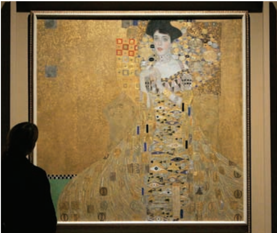
A visitor at the Los Angeles County Museum of Art views a painting titled "Adele Bloch-Bauer (I)," on April 4, 2006, one of several paintings by Gustav Klimt seized by the Nazis in 1938.

This Internet portal provides a searchable registry of objects in U.S. museum collections that changed hands in continental Europe during the Nazi era (1933–1945).