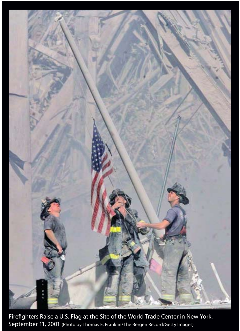
Firefighters Raise a U.S. Flag at the Site of the World Trade Center in New York, September 11, 2001

While there are differences among the definitions of terrorism given in the textbooks, none of them allows for the possibility that its definition could be contested or wrong. That is, they present terrorism as an established concept that means the same thing everywhere. By contrast, terrorism is presented as a contested concept in the written materi-