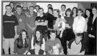
The Election Class of 2004