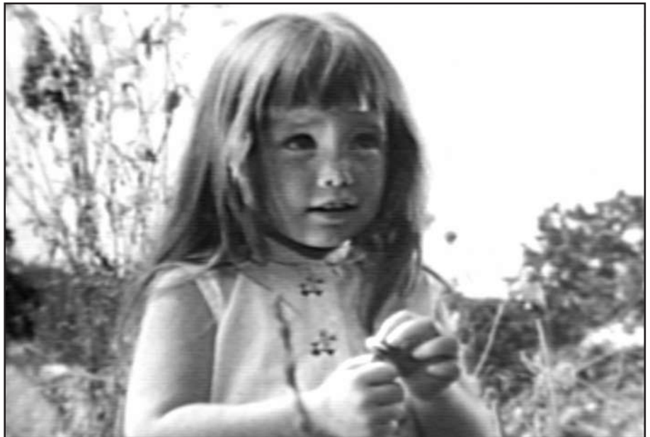
Lyndon B. Johnson's "Peace Little Girl (Daisy)" campaign ad, archived at http://www.lbjlib.utexas.edu/johnson/av.hom/streaming-index.shtm .

Which is a more powerful framing model, using families with children or individual adults in ads about national economic conditions? Find