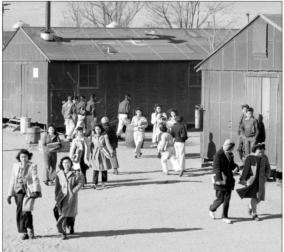
School children break for recess at a Japanese relocation camp in 1943 similar to the Poston camp where Clara Breed's library patrons were held.

The letters in Dear Miss Breed can serve as an impetus for an inquiry into the "big ideas" of equality and social justice. Another useful resource is the selected readings in Alice Yang Murray's What Did the Internment of Japanese Americans Mean? Murray's book includes writings by three activists in the redress movement of the 1970s