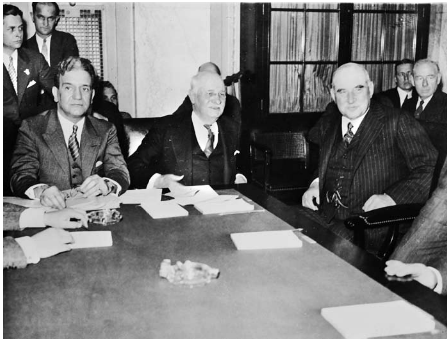
Photo of Counsel Ferdinand Pecora, Chairman Duncan Fletcher, and witness J. P. Morgan, Jr., during a break in the Senate Banking Committee hearings, May 1933.

The misdeeds exposed by the Senate Banking Committee investigation rendered a blow to public confidence in the banking system by revealing its dark underbelly. But the investigation also provided detailed information about what was wrong, so that legislation could be produced to address the core problems. Efforts to radically alter or abolish the capitalist system (ideas that were supported by the growing Communist Party) were cast aside in favor of removing specific miscreants and revising rules to prevent further abuses. The investigation, therefore, resulted not in a revolutionary overthrow of the capitalist financial system, nationalization, or centralization, but rather a “legislative legacy” of government regulation to curb the worst abuses. The careful documentation of exploitative financial practices in the public hearings had provided the factual basis and the public support for remedial legislation.