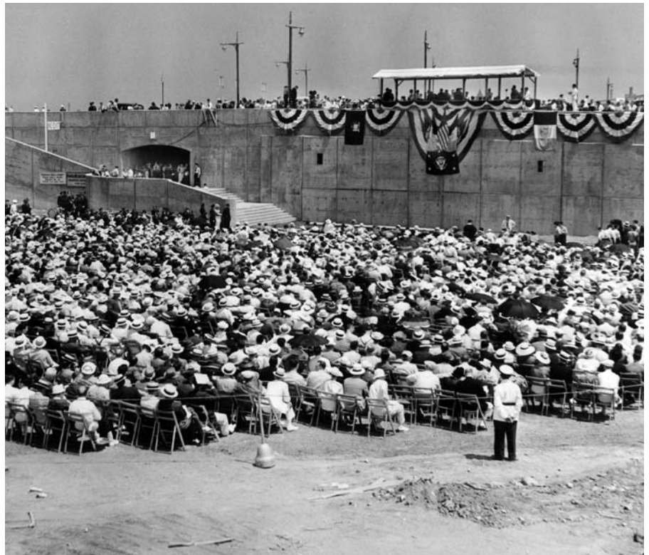
Franklin Delano Roosevelt speaks at the dedication of the Triborough Bridge from Randall’s Island in New York City.

employed 8.5 million people and spent $10.5 billion. Roosevelt called the WPA “The most comprehensive work plan in the history of the nation.” When the dust had cleared, the results from WPA projects included 650,000 miles of roads, 125,000 civilian and military buildings, 800 airports, 16,100 miles of water mains and distribution lines, and 78,000 bridges, among them the Triborough. Approximately 20,000 persons were engaged in some manner during the construction period. Triborough Bridge and La Guardia Airport in New York, Camp David Presidential Retreat in Maryland, and Dealey Plaza (a city park in Dallas, Texas) were some of the most noteworthy WPA projects. The results were dramatic as unemployment dropped, the size and power of the federal government increased significantly, and America’s infrastructure was renewed. Indeed, the work of millions of Americans in the 1930s benefited the United States long after the Depression ended.