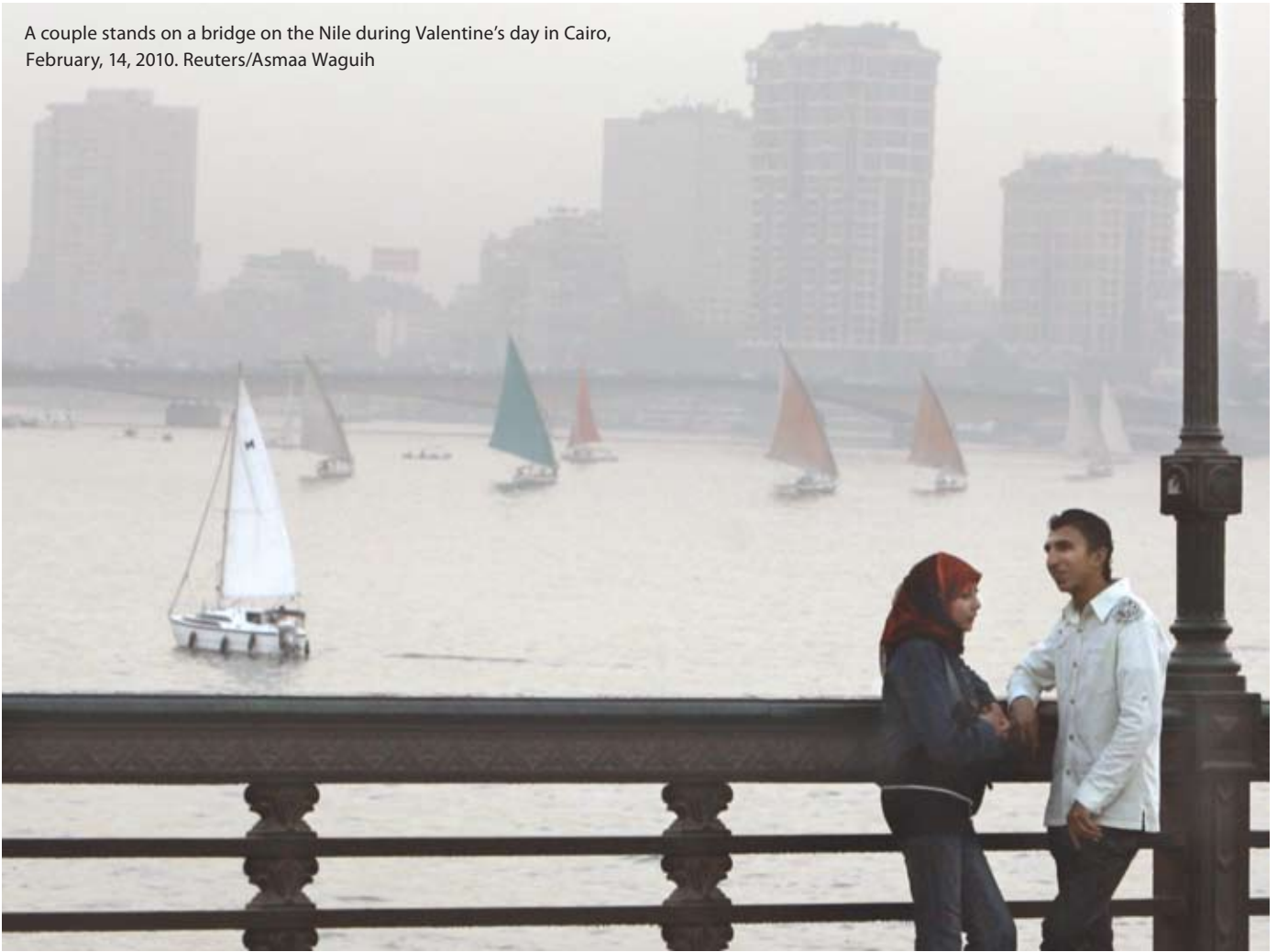
A couple stands on a bridge on the Nile during Valentine's day in Cairo, February, 14, 2010.

appropriate Qur'anic verses to enhance the final effect. 6 (¶ 27).