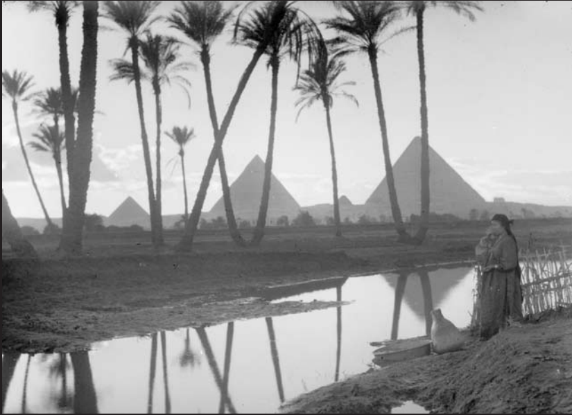
The three pyramids seen through a palm grove, Cairo, Egypt. Matson Photo Service, 1936 (Courtesy of the Library of Congress, LC-DIG-matpc-00273).

covered with dowry coins. Today, the women, many who are artisans, create colorful, exquisitely embroidered dresses, shawls, pillow covers, and scarves to sell each Thursday to tourists in the marketplace.