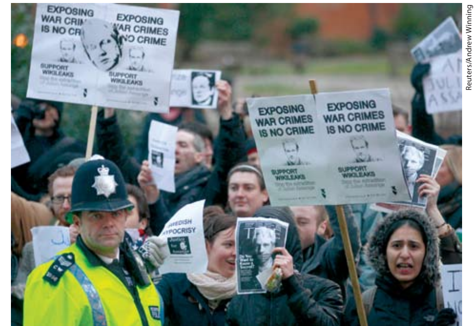
Supporters of WikiLeaks founder Julian Assange cheer outside Westminster Magistrates Court in London after he was given bail on December 14, 2010. Assange, wanted in Sweden for alleged sex crimes, is the target of U.S. fury over the release of secret diplomatic cables.

Assange is a tempting prosecutorial target for both practical and legal reasons. Practically, it is easier to prosecute a colorful but disagreeable character like Assange than the editor of The New York Times . Legally, the Espionage Act has been interpreted to require prosecutors to prove that a person intended to harm the United States. Abrams told NPR in a recent interview that because of Assange's comments about the United States, he had "gone a long way down the road of talking himself into a possible violation