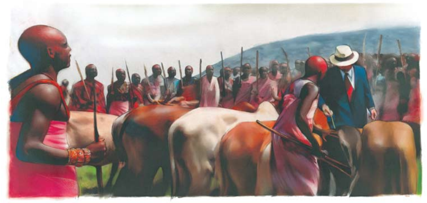
Painting by James Cloutier from 14 Cows for America.

to the people of the United States. In this article, we suggest a lesson plan for using the book in class in a way that is grounded in the national social studies standards.