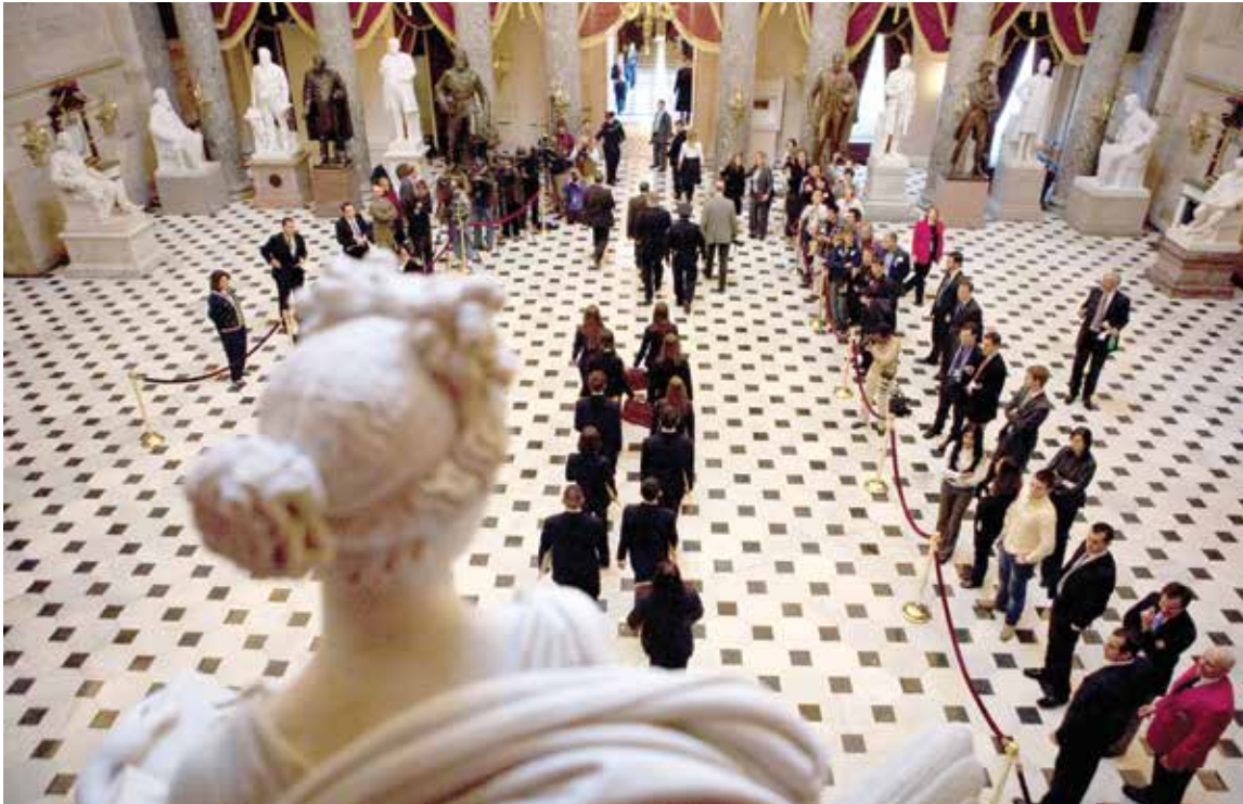
Ballots from the Electoral College are carried into the House Chamber for a joint session of Congress to count the ballots in Washington, D.C., January 8, 2009. Barack Obama was confirmed as president-elect.

candidates from outside their state, people might only vote for candidates from their own states or region, and no candidate would emerge with a majority vote, or the largest and most populous states would control elections.