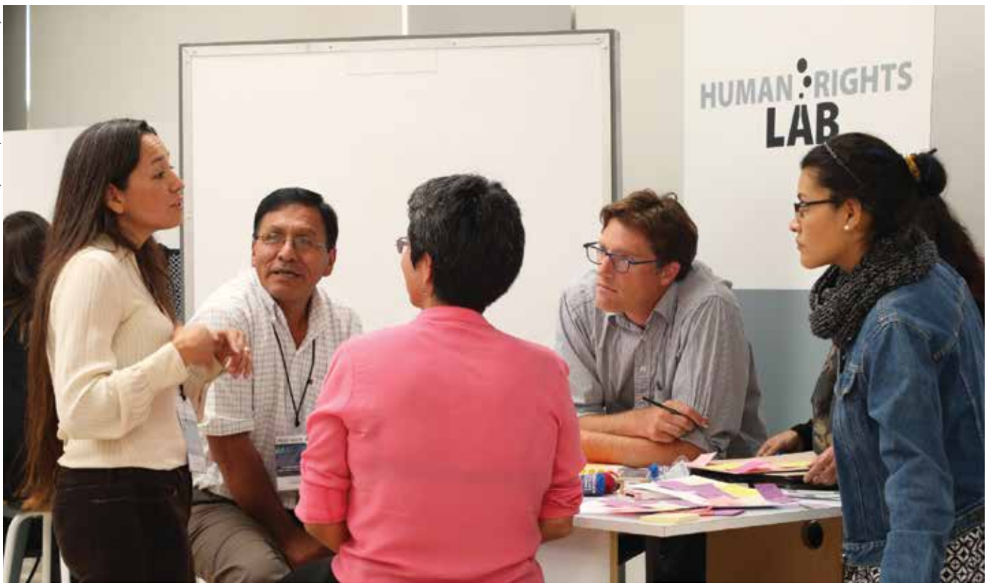
A Comparative Constitutions Project human rights workshop at Dejusticia/Universidad Los Andes in Bogotá, Colombia, on crafting a constitutional provision for building a new constitution.

an academic research program, but we also recognize that wider audiences are interested in the world's constitutions. To meet that interest, we have recently tried to make constitutional texts available to students and teachers in what we hope is an innovative way.